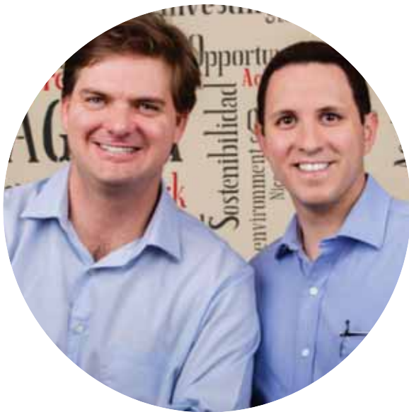
Agora Venture Fund 2005