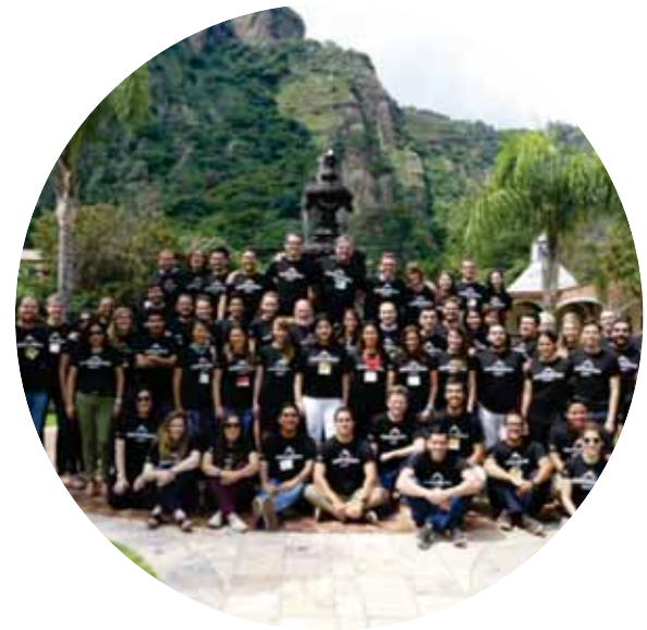
Agora Accelerator 2011