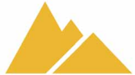
ACCESS TO CAPITAL